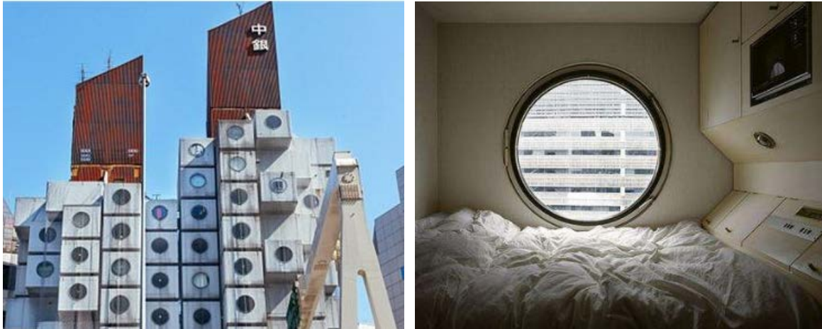
Fig. 3 External and internal scenes of Nakagin Capsule Tower

of the development in human society. Nakagin Capsule Tower is a prefabricated building conceived from growth (figure 3). The building consists of 140 hexahedron compartments that can be added or subtracted according to the user's wishes. As the main function space, the equipment and storage space are unitized, embodying the adaptability of cell division and regeneration.