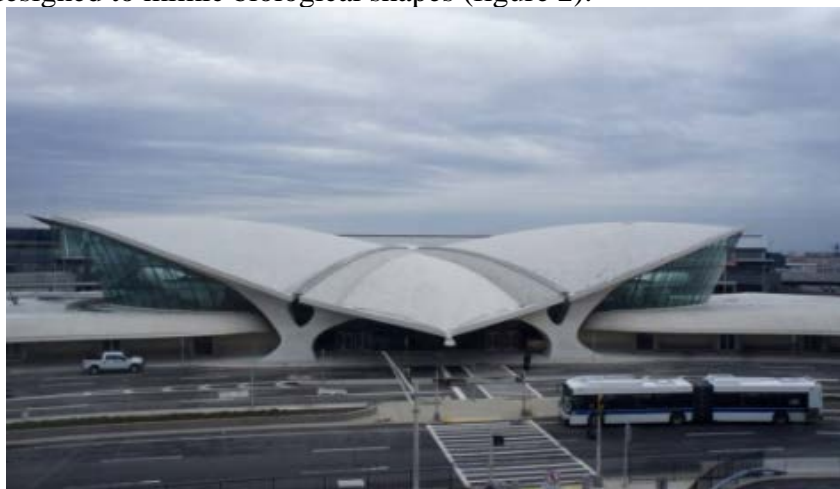
Fig. 2 A temporary terminal building at New York's Kennedy Airport

Morphological bionics refers to a design technique that directly imitates the morphological characteristics of natural organisms and gives dramatic and artistic processing effects, which enables the people watching to play their own associative power and increase the affinity to use. For example, a temporary terminal building at New York's Kennedy Airport was designed by Schallin, which was also designed to mimic biological shapes (figure 2).